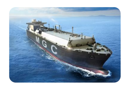
Mark III "NH3 Ready"