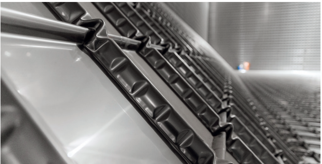
The distinctive waffled stainless steel primary barrier of a GTT Mark III membrane tank

The LNG supply chain has also been extended dramatically. Floating LNG production and regasification vessels have opened up new gas export and import opportunities, while the fleet of coastal distribution tankers continues to grow. In addition, the first purpose-built LNG bunker vessels are now in service and more shipowners outside the gas carrier sector are choosing to